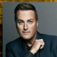
MICHAEL W. SMITH