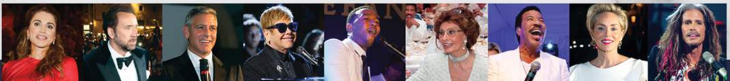
HER MAJESTY QUEEN RANIA AL ABDULLAH